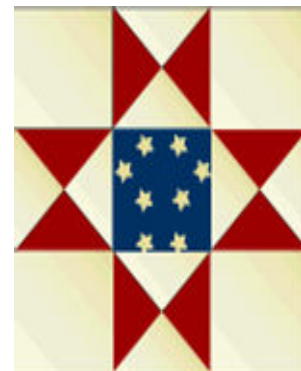
Size: 12" Finished

2 squares 5 1/4" x 5 1/4", cut twice diagonally to make 8 triangles